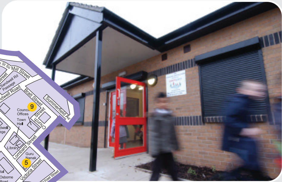
Building work to create one school for Guns Village included the creation of a new community room.

then a brick skin was built around them. Lodge primary school had two spare classrooms that were refurbished as community facilities complete with access for disabled people. These rooms can now be used without opening the school. A new Children's Centre is nearing completion at Ryders Green primary school while George Salter High School is working on a co-operative partnership with Greets Green Partnership and four other local primary schools as part of the Extended Schools scheme.